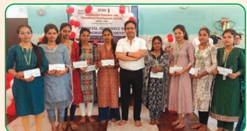
SEEDS scholarship distribution for nursing students

“Coming from a marginal farmer's family, luckily I got my admission in prestigious SCB medical college, Cuttack, Odisha. But financial crisis appeared insurmountable to continue my study. At this time, LBW Trust through Vikash Educational Charitable Trust helped me a lot to remove my financial obstacles. With the help of LBW Trust, I have completed my MBBS smoothly. Now I have completed my MD in Paediatric and am working in a Govt. Hospital. I bow to LBW Trust for providing me scholarship during my worst days.”