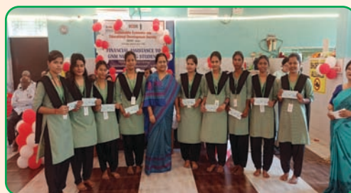
Schoalrship for Kalinga Nursing Students

“During my engineering studies, I was fortunate to receive the prestigious scholarship from LBW Trust Australia in collaboration with Vikash Educational Charitable Trust. The profound impact of this scholarship transcends my individual achievements. It has sparked a ripple effect of positive change, in my immediate family and community. I stand as a testament to the transformative power of merit-based support.”