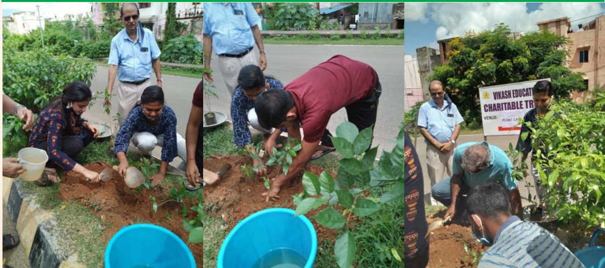
Tree plantation by Vikash Educational Charitable Trust

VECT has conducted tree plantation program in which the board members, staff & student volunteers have planted trees