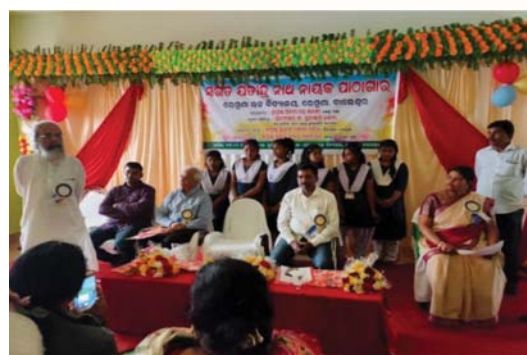
Jatindra Nath Library building inauguration