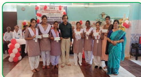
Sri Bajrang Power & Ispat Limited scholarship distribution for students.