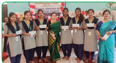
SEEDS scholarship distribution for nursing students

“The financial assistance provided by LBW has significantly helped me to complete my MBBS degree successfully. Thank you again for your investment in me. I am deeply appreciative of your belief in my potentiality. I hope to make you proud and will contribute to help other needy students. I wholeheartedly wish your Trust the very best.”