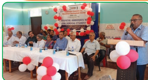
SEEDS, USA scholarship distribution for GNM students.

“My connection with VECT started when my father could not make provision for my tuition fees during Covid pandemic. During those tough times, I received financial assistance from VECT and LBW Trust for which I could continue my B.Tech. Course. VECT and LBW Trust have been generous enough to continue their assistance for subsequent years for which my study is going smoothly without hindrance. I shall remain ever grateful to VECT and LBW Trust.”