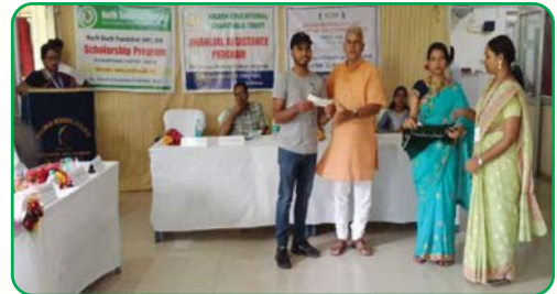
Scholarship distribution in Kalinga Nursing School

“During one of the most challenging times for our family, when penury threatened to interrupt my education, the scholarship by LBW Trust Australia stepped in as a beacon of hope. Their generous support not only made me a doctor but also reinforced my faith in kindness and humanity. I hope to uphold the trust placed in me and in future, will give back to society just as you have given to me.”