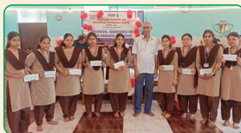
Scholarship for Kalinga Nursing Students

Thank you for believing in me and empowering me to create a better future for myself and my family."