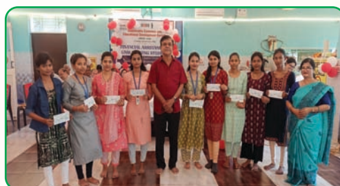
LBW Scholarship Cheque Distribution for students

"The scholarship by LBW had significantly helped my academic journey, providing me with the opportunity to pursue my educational and professional goals with greater focus and determination. The LBW Scholarship is not just a financial aid but a symbol of trust in my potential. It motivated me to work harder."