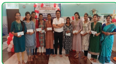
M/s. M.G. Mohanty Schoalrship for Nursing students

“I was born in a poor rural family of Balasore district of Odisha. My father was a daily labourer. I managed to complete my High School education with the help of my teachers and relatives. I had a wish to be a doctor. I secured Rank 67 in the Odisha Medical College Entrance Examination in 2010 and got the opportunity to study MBBS in SCB Medical College, Cuttack. But I required a large amount of money for continuation of my study and was in trouble. Then I came to know about the scholarship by LBW Trust, Australia, from my seniors and contacted VECT, Bhubaneswar. I applied for and got the scholarship. Now I am serving in a government hospital in rural Odisha. I am forever grateful to LBW.”