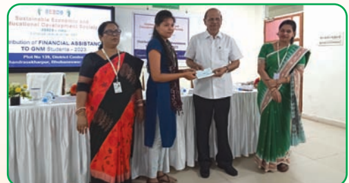
SEEDS scholarship distribution for GNM students

“From counting cattle heads in a rural tribal village of Rayagada to advancing bio-inspired robotic and healthcare designs in a sophisticated laboratory in Chennai, my path has been both long and eventful. I earned a Bachelor's in Electrical Engineering, supported financially by VECT and LBW trust and a Master's in Industrial Automation Engineering from University of Aveiro in Portugal. Currently, I am pursuing my Ph.D. at the IIT, Madras in Chennai, India, focusing on sensor design and mathematical analysis for robotic applications. I am indebted to LBW for their trust and assistance.”