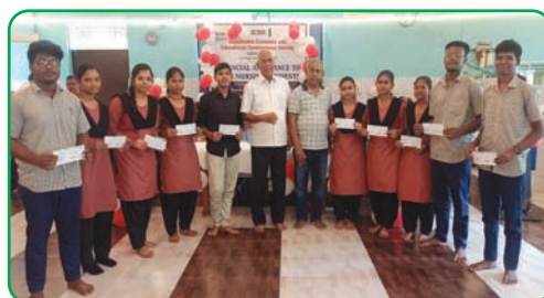
SEEDS, USA scholarship distribution for Kalinga Nursing School students.