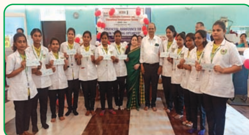
Scholarship distribution for KIIT Nursing school students

"First of all, thanks for the assistance given by LBW Team during my graduation which helped me to concentrate on my study and achieve my goal. Currently, I am working with Virtusa IT Service as an Associate Manager in Hyderabad."