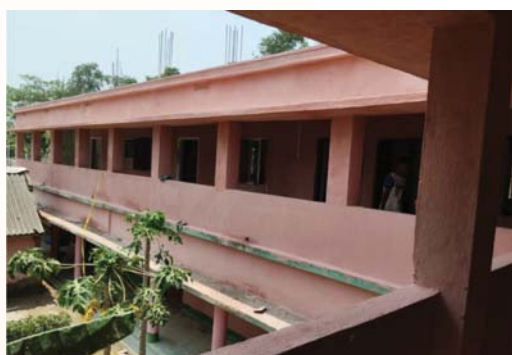
Aurobindo Purnanga Sikshya Kendra School building construction